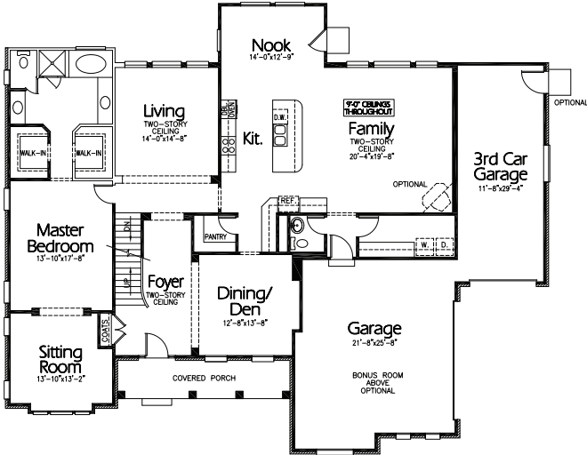
Main Floor 2,424 sq ft